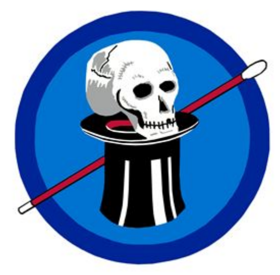
15<sup>th</sup> Fighter Squadron emblem